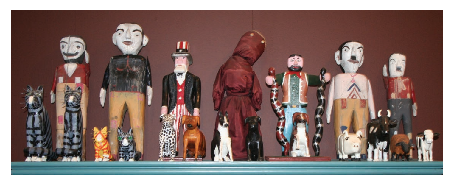
Blue Shelf, from the Collection of Gregg Blasdel and Jennifer Koch.

A major portion of the exhibition contained a variety of everyday objects transformed by the artful insertion of imaginative whimsy. Walking sticks sported elaborate hand grips (decorative impulses that defy the canes' utility), water jugs glared with mask-like faces, a row of wooden carvings presented a number of fantasy figures based on everyday people and animals.